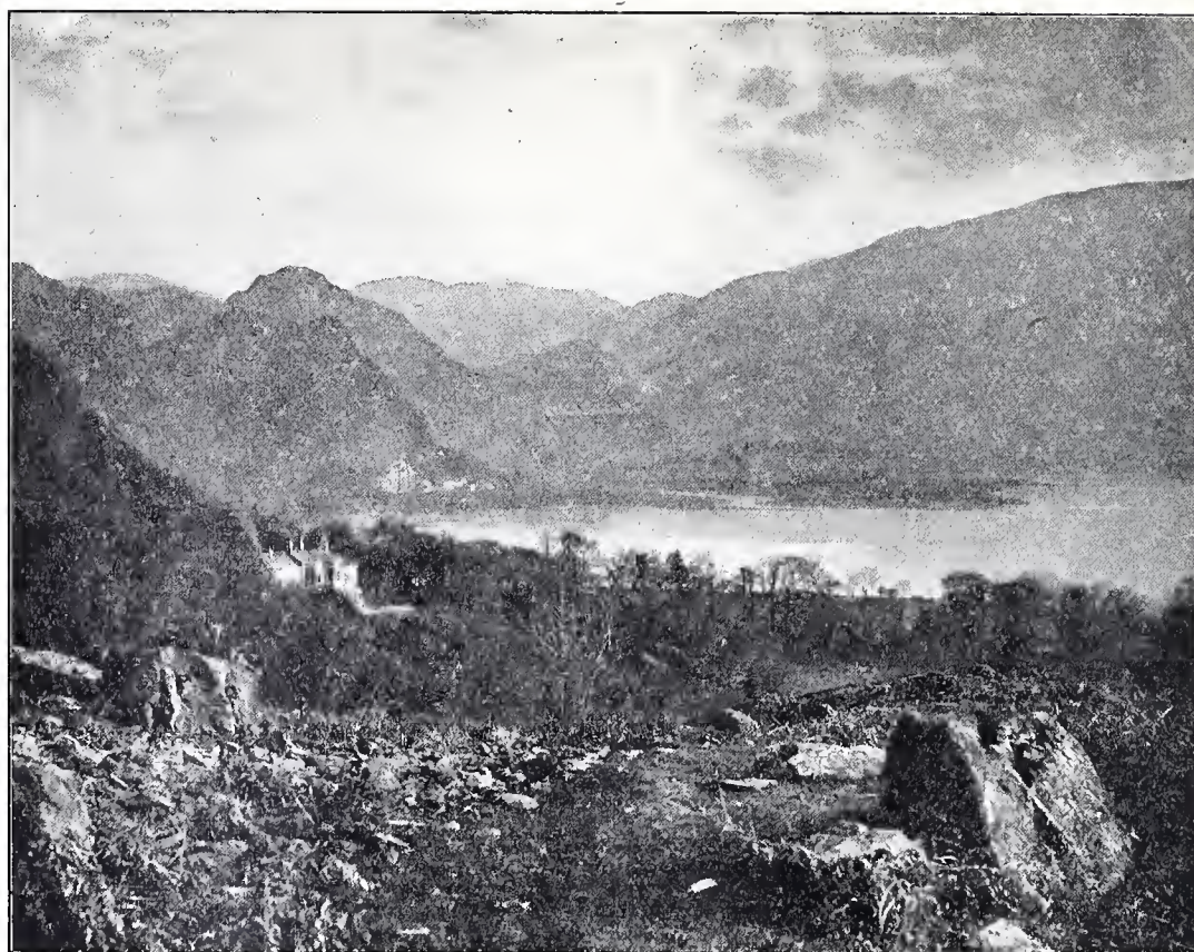
The Head of Derwentwater and Scafell, showing Barrow House and Grounds.