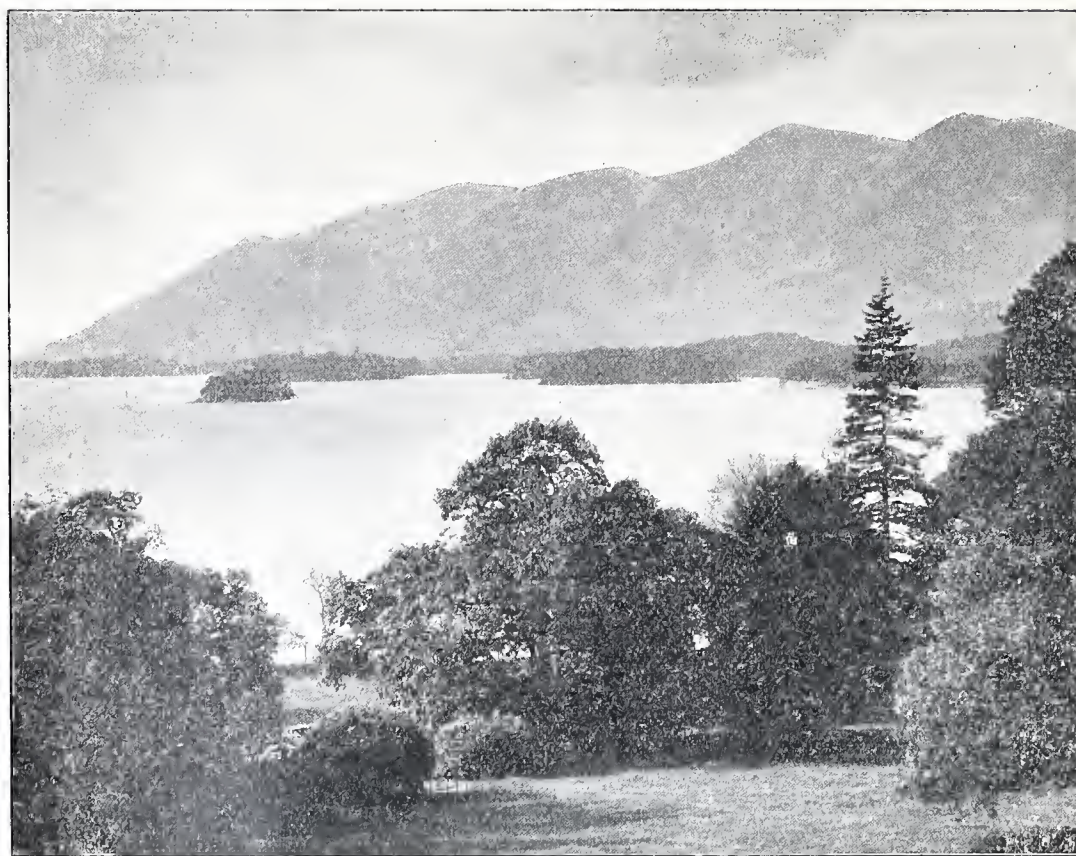
Derwentwater and Skiddaw, taken from the front of Barrow House.