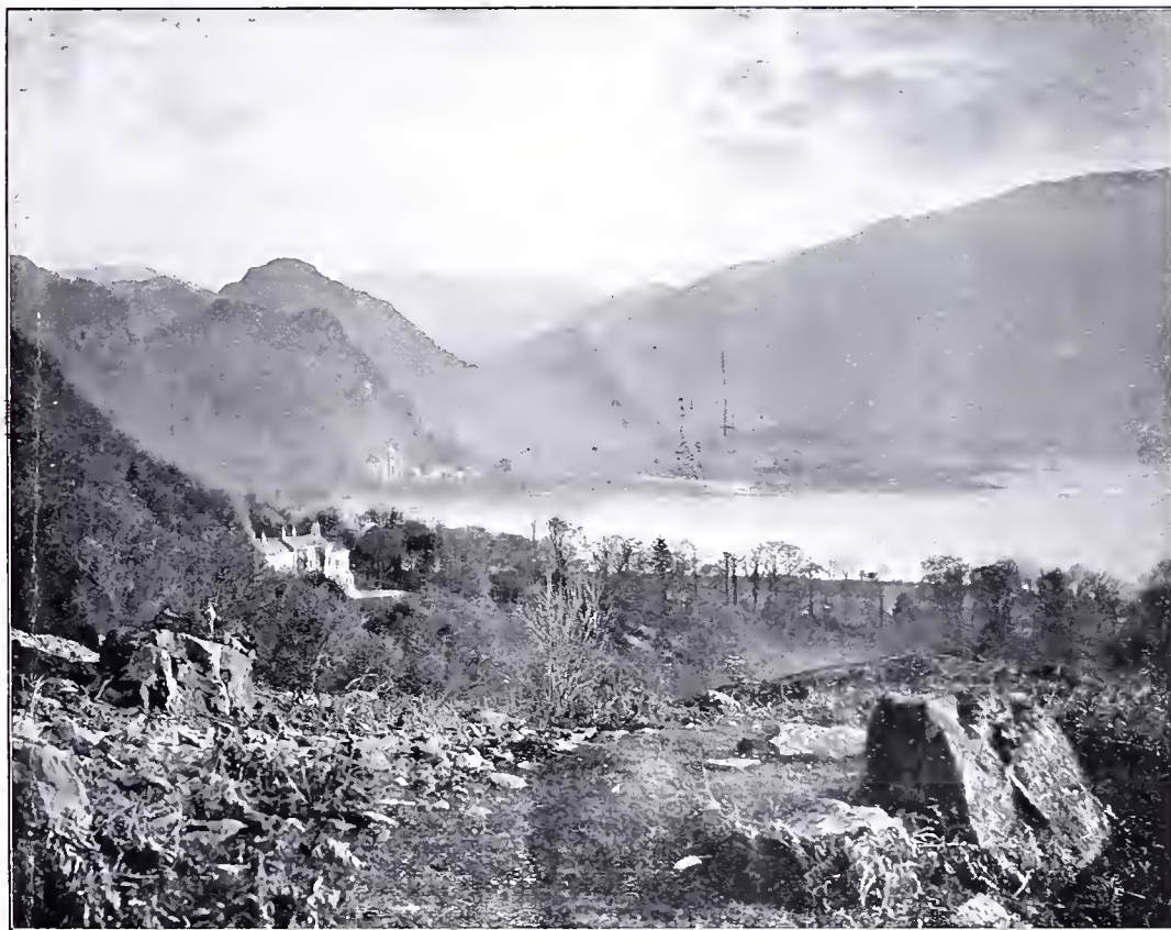
THE HEAD OF DERWENTWATER AND SCAWFELL, SHOWING BARROW HOUSE AND GROUNDS.

PRELIMINARY PROGRAMME—SUBJECT TO ALTERATIONS AND ADDITIONS.