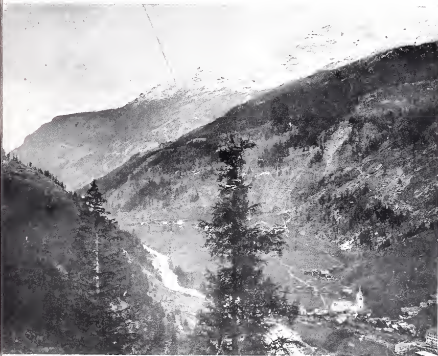
The Village of Saas-Grund.

HOTEL MONTE MORO, SAAS-GRUND, VALAIS, SWITZERLAND.