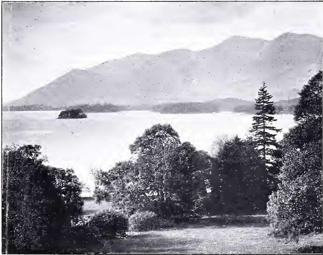
DERWENTWATER AND SKIDDAW, TAKEN FROM THE FRONT OF BARROW HOUSE.